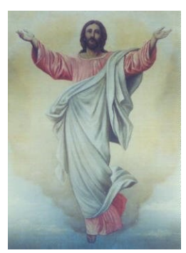
Come and See!

A Pilgrimage of Faith to Encounter Jesus