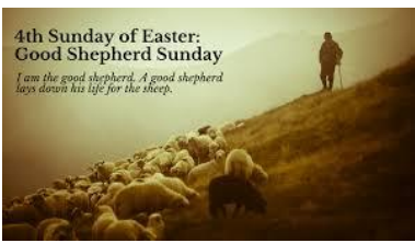
4th Sunday of Easter: Good Shepherd Sunday I am the good shepherd. A good shepherd lays down his life for the sheep.