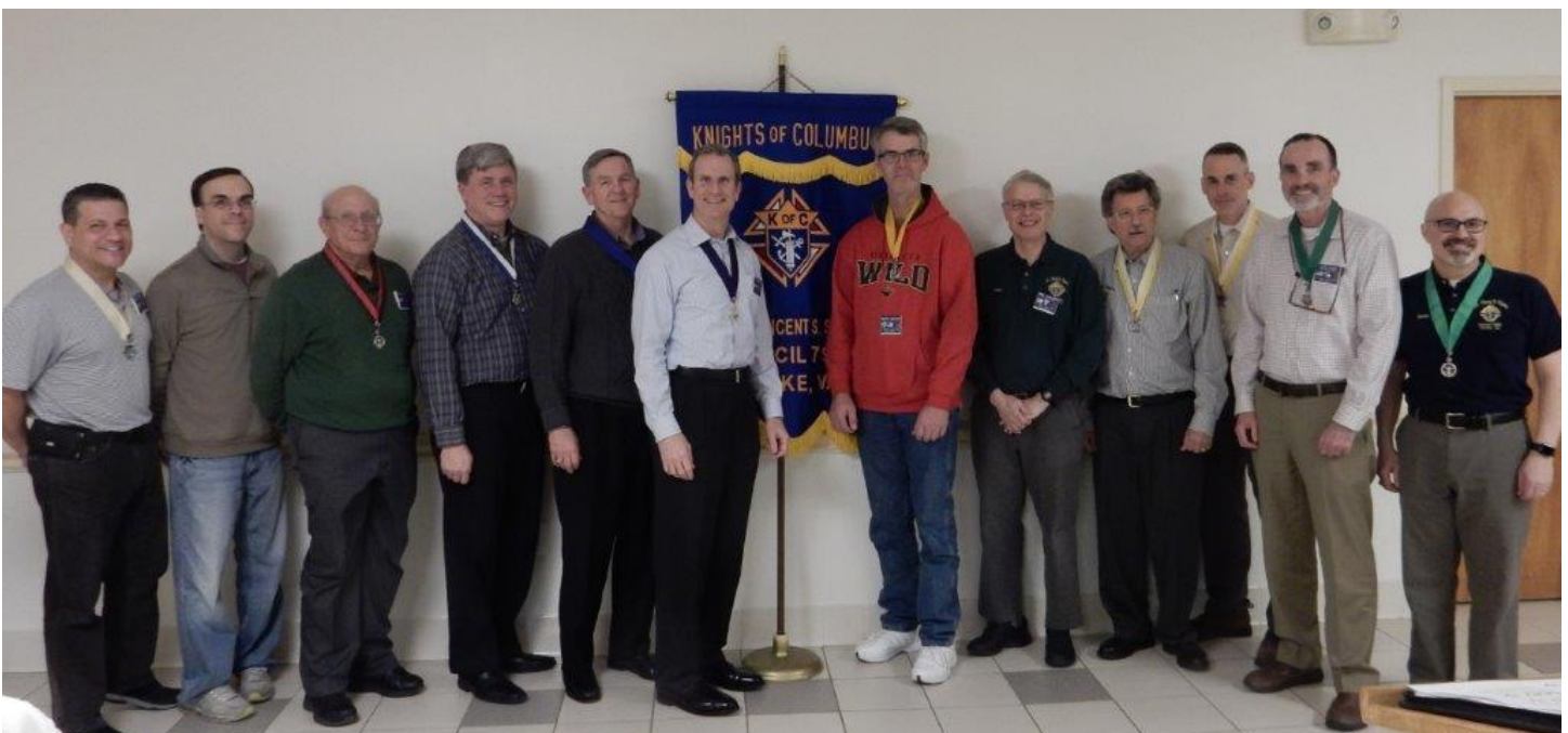
Below: Council 7992 Officers